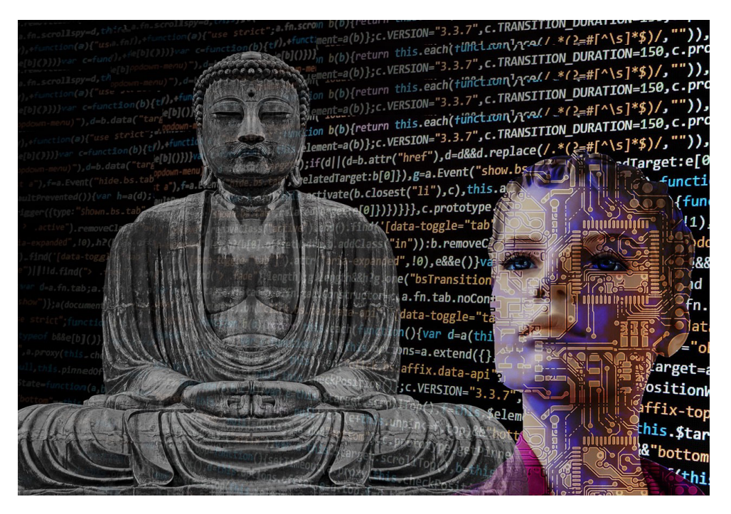
Figure 1 — Hearing, Contemplation, and Meditation for Brain-Mind Translation

Buddhist wisdom (prajna) comprises three tools namely hearing (Sutas), contemplation (Cinta), and meditation (Bhavana). For intellectual understanding, we have to hear, learn, and study (sutras). We can internalize this knowledge through the wisdom of contemplation and reflection (Cinta). Based on these two pearls of wisdom, we begin to practice meditation (Bhavana) further awakening our inner understanding. During the stabilization (Samatha) meditation and insight (vipassana) meditation the brain is the object of a cognitive process that is turned inward rather than outward. The values are assigned to certain states to increase their prevalence. The synaptic connectivity changes accordingly. It is somewhat similar to what happens in the learning process through interactions with the outer world. The three Buddhist wisdom tools are symbolically represented in Figure 1.